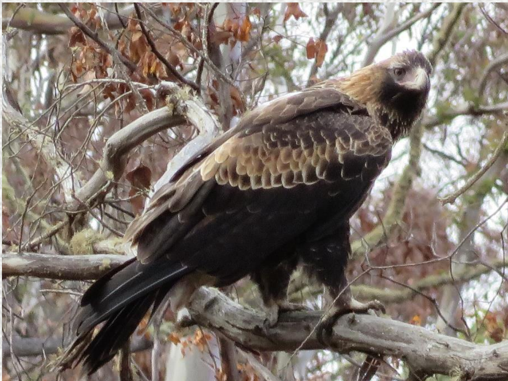
St Patricks Plains Wedge-tailed eagle

Your support will help us fund research, advocacy and publicity about St Patricks Plains turbines and give us access to the best expert and legal advice in Australia.